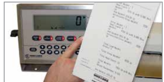
Weigh Ticket of Total Number of Animals Weighed on Scale

Your Rice Lake Weighing Systems distributor is: