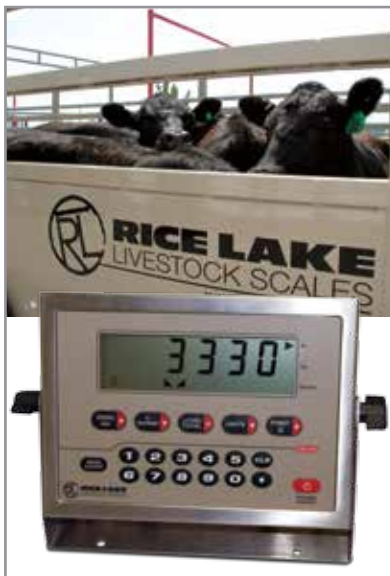
Weighing First Group of Cattle