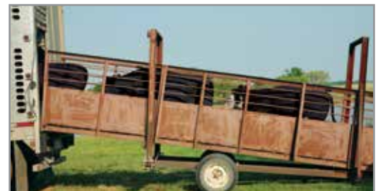
Total Number of Cattle and Weight of Cattle Loaded onto Truck