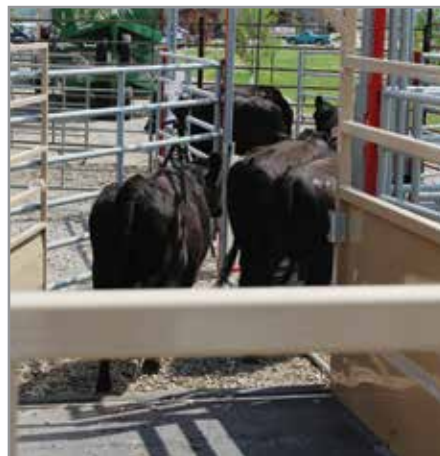
Cattle Leaving Scale